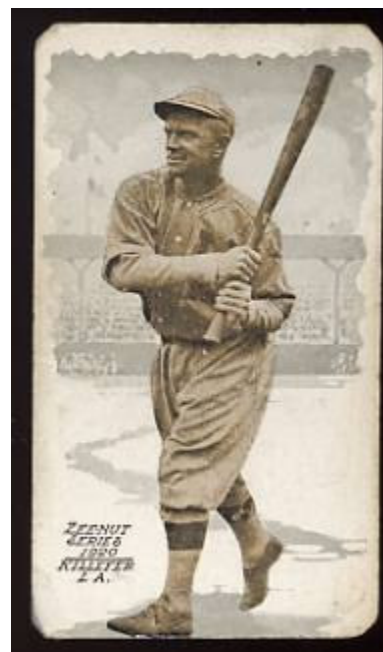
Above: Red Killefer

Interestingly, Red led the American League (1910) and the National League (1915) in being hit by pitches; 16 times in 1910 and 19 times in 1915.