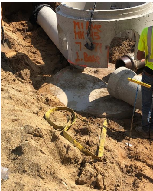
Phase II – Setting A New Drainage Structure