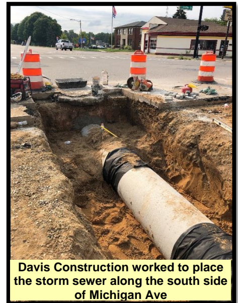
Davis Construction worked to place the storm sewer along the south side of Michigan Ave